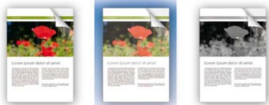
Normal colour print 'Level Color™' print Normal B/W print