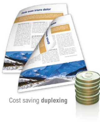
Cost saving duplexing